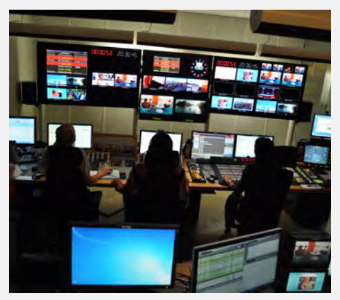
TV 2 Studio