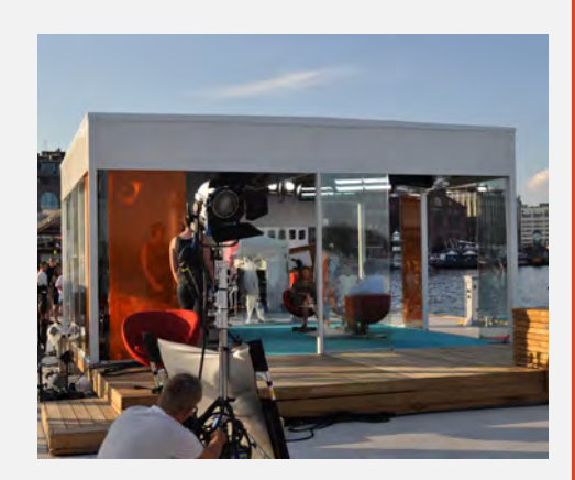
TV 2 Sommertid Program

These niche channels complement TV 2 Zebra that has broadcast entertainment to younger Norwegians since 2005. The film channel, TV 2 Filmkanalen broadcasts films 24 hours a day.