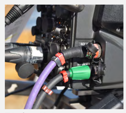
TV 2 Coax Mode

Additionally there's a third test that has to be overcome – and this is not about technical issues, but all about the human interaction between the teams. Put simply, the 'communication test' is: can all production staff communicate efficiently so that the program can be made just as well when the audio engineers, lighting controllers, technical directors and vision directors are kilometers rather than meters away from the cameramen and the talent on screen.